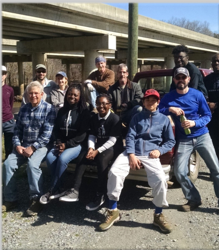
Volunteer team for one of FLOHA's river clean-up events March 2019

We are fortunate to have a terrific team of volunteers who have been able to carry on with our trash can, bird house, and wildlife camera projects in LOHA that can be done alone or with family. LOHA has remained open during the pandemic, but with our group outings on hold, we've been exploring LOHA virtually with our "Enjoying Nature Through a Lens" feature in our e-newsletters. LOHA is a popular place for nature photography and we're fortunate to have fabulous photographers willing to share their images for use in our e-newsletters and social media. During the pandemic, LOHA has taken a beating with the dramatic increase in visitation and the resulting increase in problems with trash, graffiti, and illegal activities like camping, campfires, and alcohol parties.