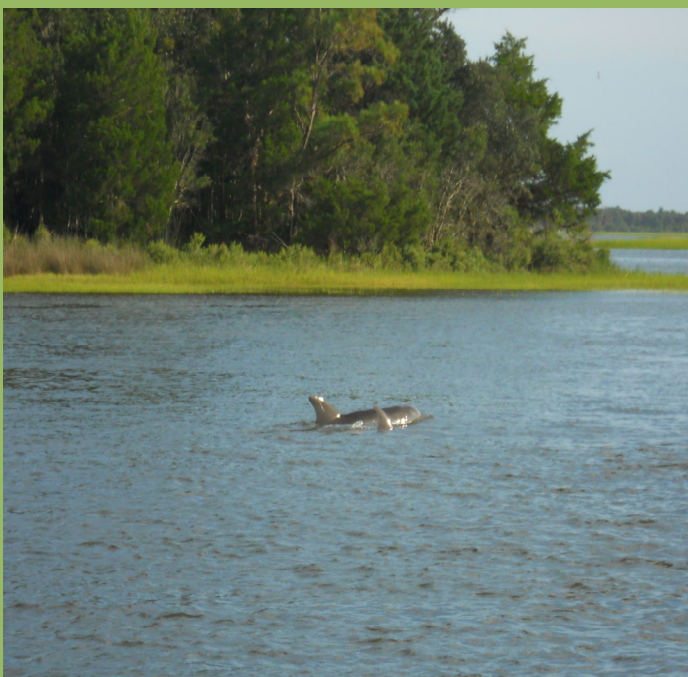
By: Pam Pearson, Friends of the Hammocks and Bear Island

Each year, Friends of the Hammocks and Bear Island, Inc. (FHBI) offers fall marsh cruises around Bogue Sound. The one and a half to two-hour interpretive tour leaves the Hammocks Beach State Park mainland and navigates the waterways around Bear Island, Huggins Island and Swansboro on a Coast Guard-inspected pontoon boat. Each fall FHBI holds approximately 21 marsh cruises to promote Hammocks Beach State Park. COVID-19 considerations have reduced the capacity for this year's trips which take place on Wednesday's and Saturday's during the months of September, October, and November.