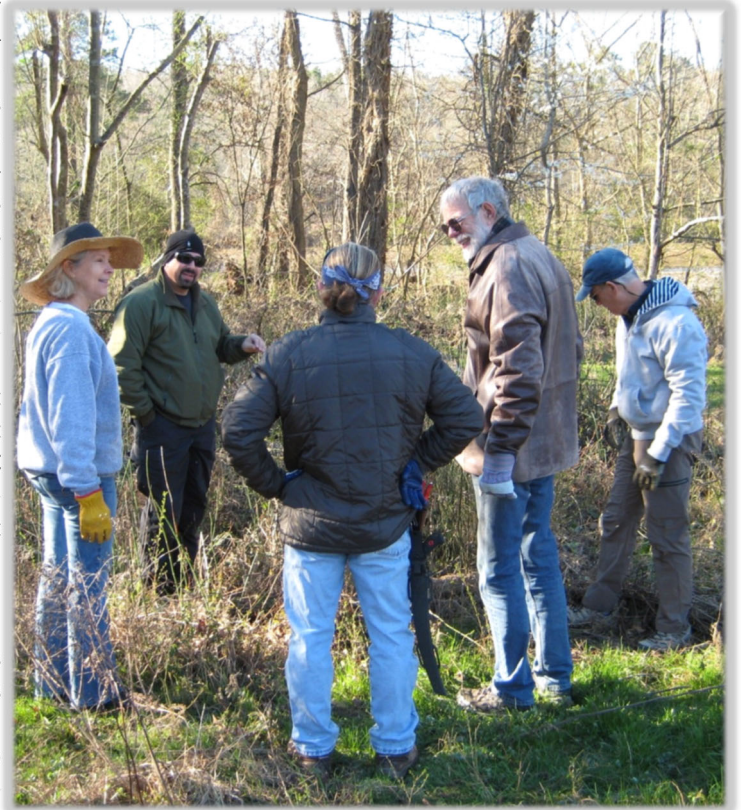
Volunteer invasive plant species workday with State Parks Biologists February 2020

Our chapter offers educational programming like guided hikes and projects that connect people with nature like our wildlife cameras and bird house monitoring. We installed trash cans at popular access points to help reduce litter, and a volunteer team empties the trash cans on a weekly basis since State Parks does not have the staff to do it. We organize river clean-up events and invasive plant species removal workdays, although we have temporarily suspended those due to COVID-19.